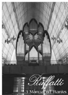
Fratelli Ruffatti Pipe Organs Padua, Italy

New 4 Manual Console to be interfaced with 45 Rank Casavant Pipe Organ at Sligo Seventh Day Adventist Church Takoma Park, Maryland